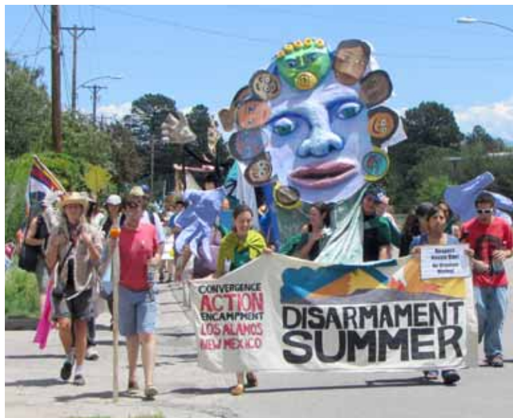
Procession from the Pond in Los Alamos to the Chemistry and Metallurgy Research-Nuclear Facility (CMR-NF) on Hiroshima Day.

Expect renewed organizing calls against new work at the NNSS. Consider joining our actions there as part of the Sacred Peace Walk next April. The Monday action will be bigger than it has in years, but we need your support and participation to make it so. (See notice of the Sacred Peace Walk on p. 4.) ☒