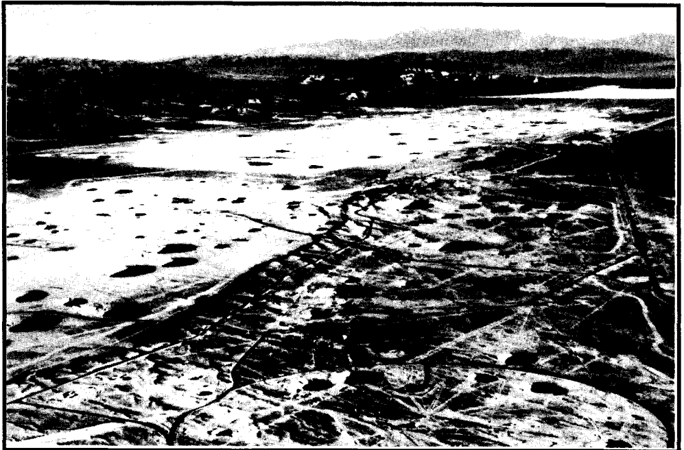
Hundreds of saucer shaped nuclear bomb craters create a "moonscape" terrain at Yucca Flat. 925 nuclear weapons tests have been detonated at the Nevada Test Site.

The mission of the Nevada Desert Experience (NDE) is to proclaim the immorality of weapons of mass destruction and to stop nuclear weapons testing through a campaign of prayer, dialogue and non-violent direct action. NDE is mobilizing people of faith to work toward nuclear abolition, including our immediate goals of ending subcritical nuclear tests at the Nevada Test Site and curtailing the Stockpile Stewardship Program.