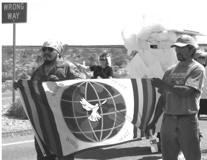
April 1 st 2007 Peace Walkers at the Nevada Test Site