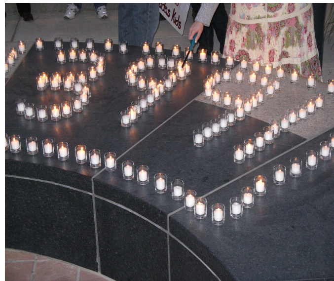
Remembering the fallen on the fifth anniversary of the war in Iraq, March 19 Candlelight Vigil in Las Vegas

This is just some of what has been going on along with the Complex Transformation Hearings, Earth, Wind, Fire and Water, An Environmental Justice Teach-In and our featured articles.