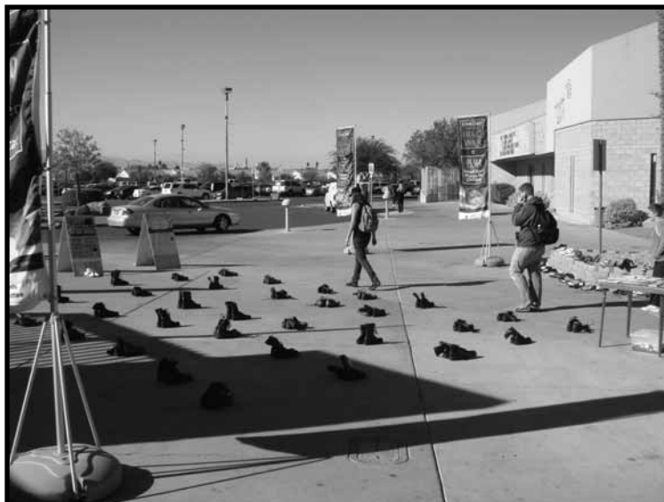
College of Southern Nevada's Cheyenne campus is a stone's throw from Nellis Air Force Base. Despite this proximity to a popular military base, most passersby were grateful for this reverent but political questioning of the "Cost of War."