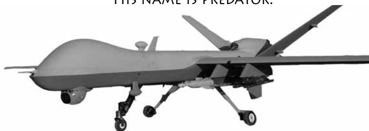
The Reaper MQ9, the younger, newer, more deadly sibling to the Predator, is also remote-controlled from Creech AFB about 35 miles north of Las Vegas.

HIS ARMS REACH AROUND THE WORLD. HIS NAME IS PREDATOR.