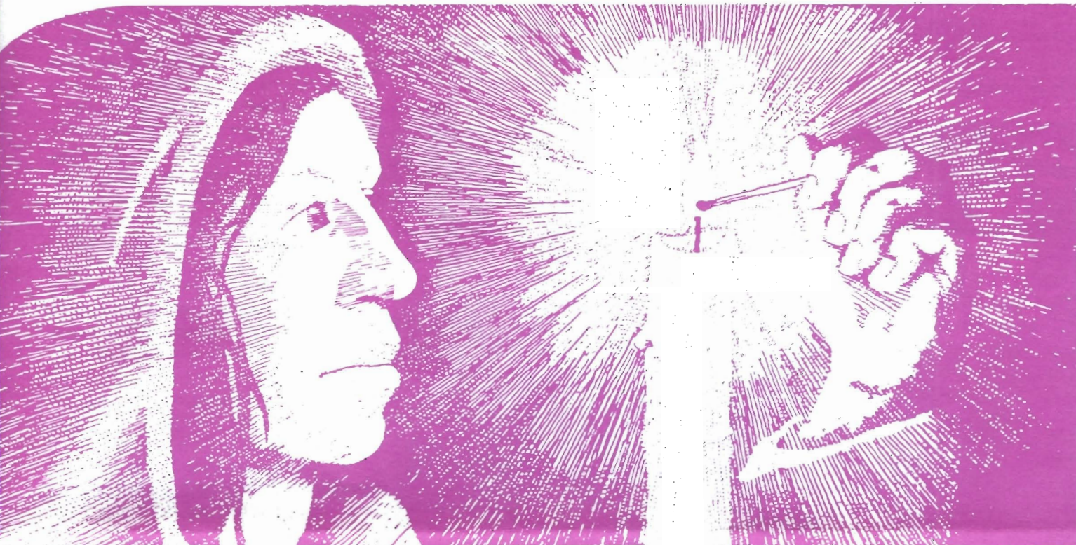
ILLUSTRATION BY DAN UNDERHILL FROM A POLARIS FOR THE SPIRIT: TOWARD IDEOLOGICAL RECONCILIATION IN A NUCLEAR AGE BY CARL CASEBOLT